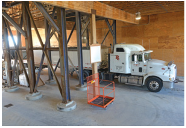
CHS is a farmer-owned cooperative with retail operations throughout the United States

"I can call or e-mail to let them know there has been a management change, then the ResponsibleAg Helpdesk folks work directly with the facility. For security reasons, ResponsibleAg takes me out of the equation. They are