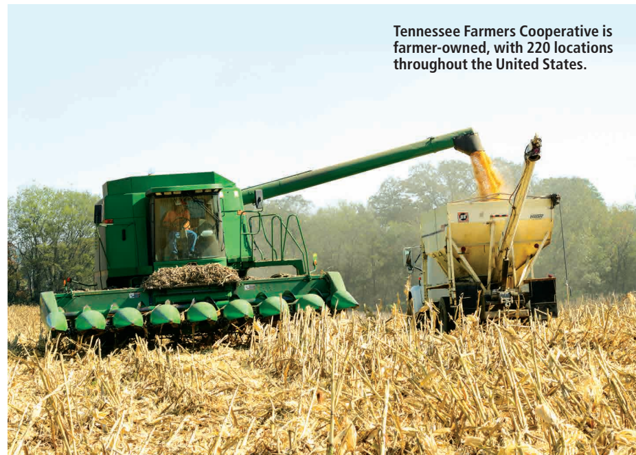
Tennessee Farmers Cooperative is farmer-owned, with 220 locations throughout the United States.

ResponsibleAg allows farmers cooperative to improve safety, lower insurance costs.